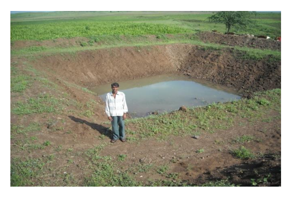
A farm pond for protective irrigation in Maharashtra