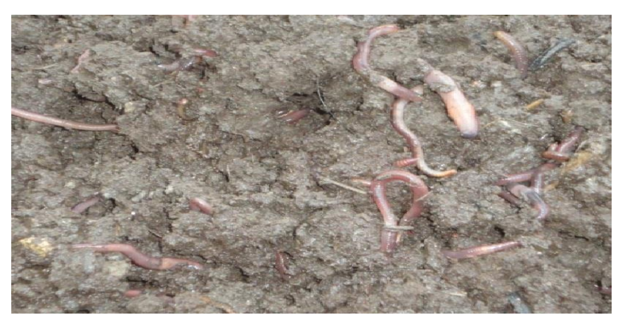
Vermi in soil

potassium. Consumption of chemical fertilisers decreased from 180kg/ha in kharif 2010 to 138Kg/ha in Kharif 2011. This has reduced the cost of production per hectare. The average yield of paddy increased and the highest ever yield of 224qtls/ha was recorded by a farmer of Nalanda District surpassing the previous Chinese record of 190qtl/ha. There has been an added advantage of 25,690MT of nitrogen fixation in the soil @70kg/ha in an area of 3.7 lakh ha where dhaincha was cultivated. Consequently, net return per hectare has increased. The above mentioned interventions have also resulted in improved soil health which is the key to sustainable agriculture.