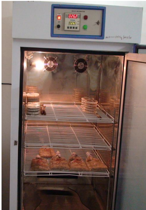
STOCK CULTURE STORAGE