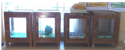
Rearing unit for mealybug and its predator

will be attended. In these days the mass multiplication of these bioagents is under smooth running. The mass rearing of important biogents, Chrysoperla carnea has been initiated during December, 2010 and is in progress.