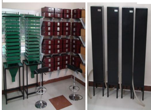
Corcyra rearing unit