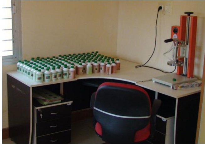
Bottle sealing machine