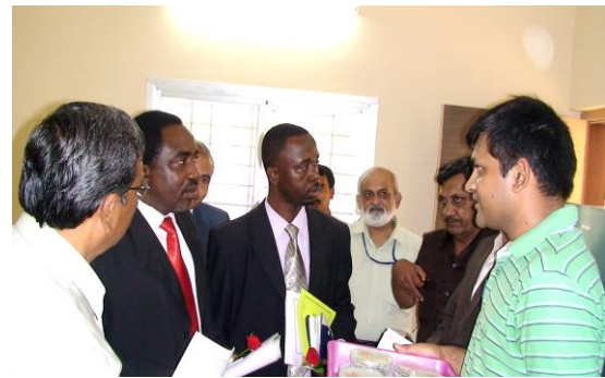
Tanzania team interacted with scientists (26/07/2010)