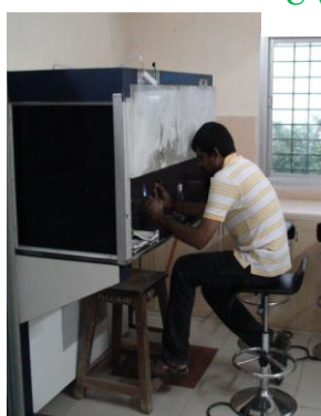
Isolation and inspection of entomopathogens