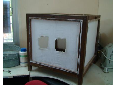
Modified device for Corcyra collection