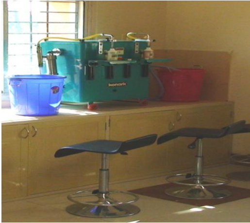
Bottle filling machine