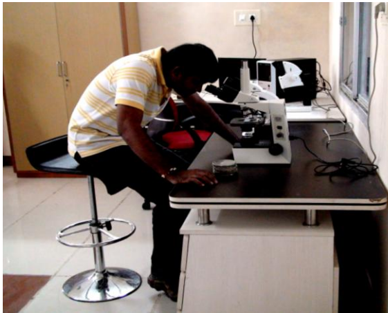
Microscopic examination of entomopathogens

Soon after the approval of project, works in relation to objectives has been started, in fact, the laboratory of entomology department was used initially until the project civil works to be complemented. The samples of diseased insects from the various fields were collected and the entomopathogens were isolated, growth on media and the pure culture was conformed for its species. The four entomopathogens, Beauveria bassiana , Verticillium lecanii , Metarhizium anisopliae and Nomuraea rileyi are judged and its pure cultures have been maintained on the ideal media.