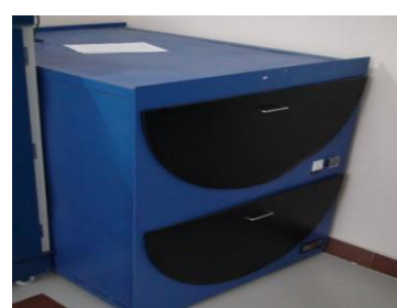
UV light sterilization chamber