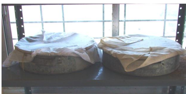
Rearing unit of Spodoptera

For the production of Spodoptera litura NPV, mass rearing of this polyphagous pest has been made in laboratory using the natural food (castor leaves) during September, 2010. Total 50000 larvae of Spodoptera were reared and used for viral infection by which NPV production has been obtained. Total 125 lit