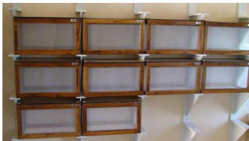
Chrysoperla rearing cage

The mass rearing of the laboratory host, Corcyra cephalonica has been started in the RKVY biocontrol laboratory during March, 2010. The eggs of Corcyra produced in mass are used for the multiplication of the egg parasitoids,