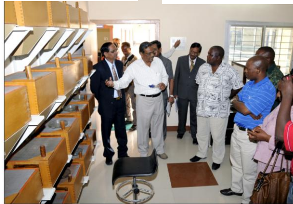
South Africa team be acquainted with Corcyra rearing techniques (06/12/2010)