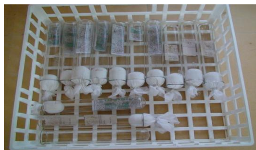
Mass rearing of Trichogramma