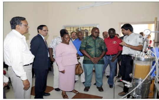
South Africa team looks the working fermenter (06/12/2010)